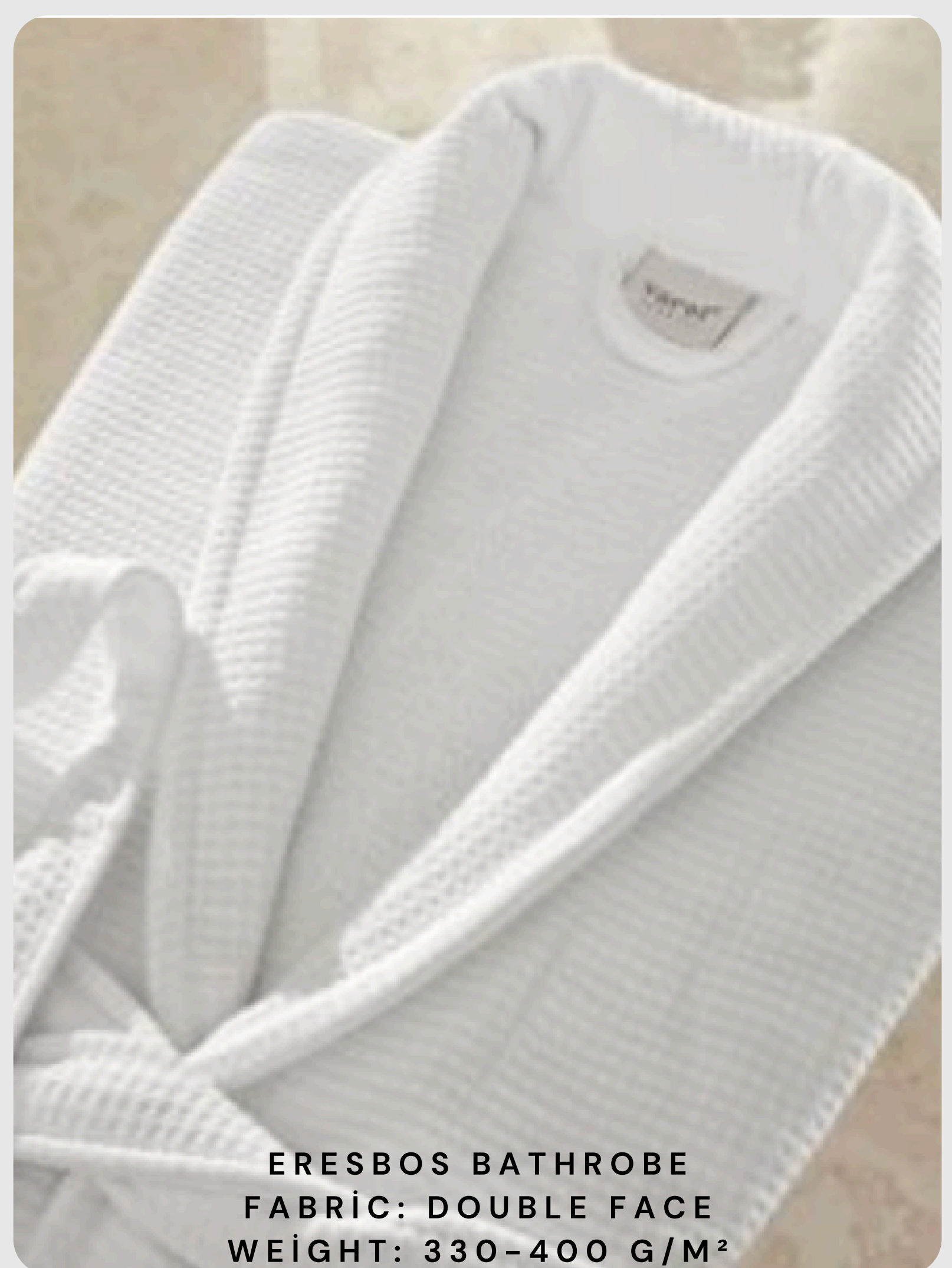
ERESBOS BATHROBE FABRIC: DOUBLE FACE WEIGHT: 330-400 G/M 2