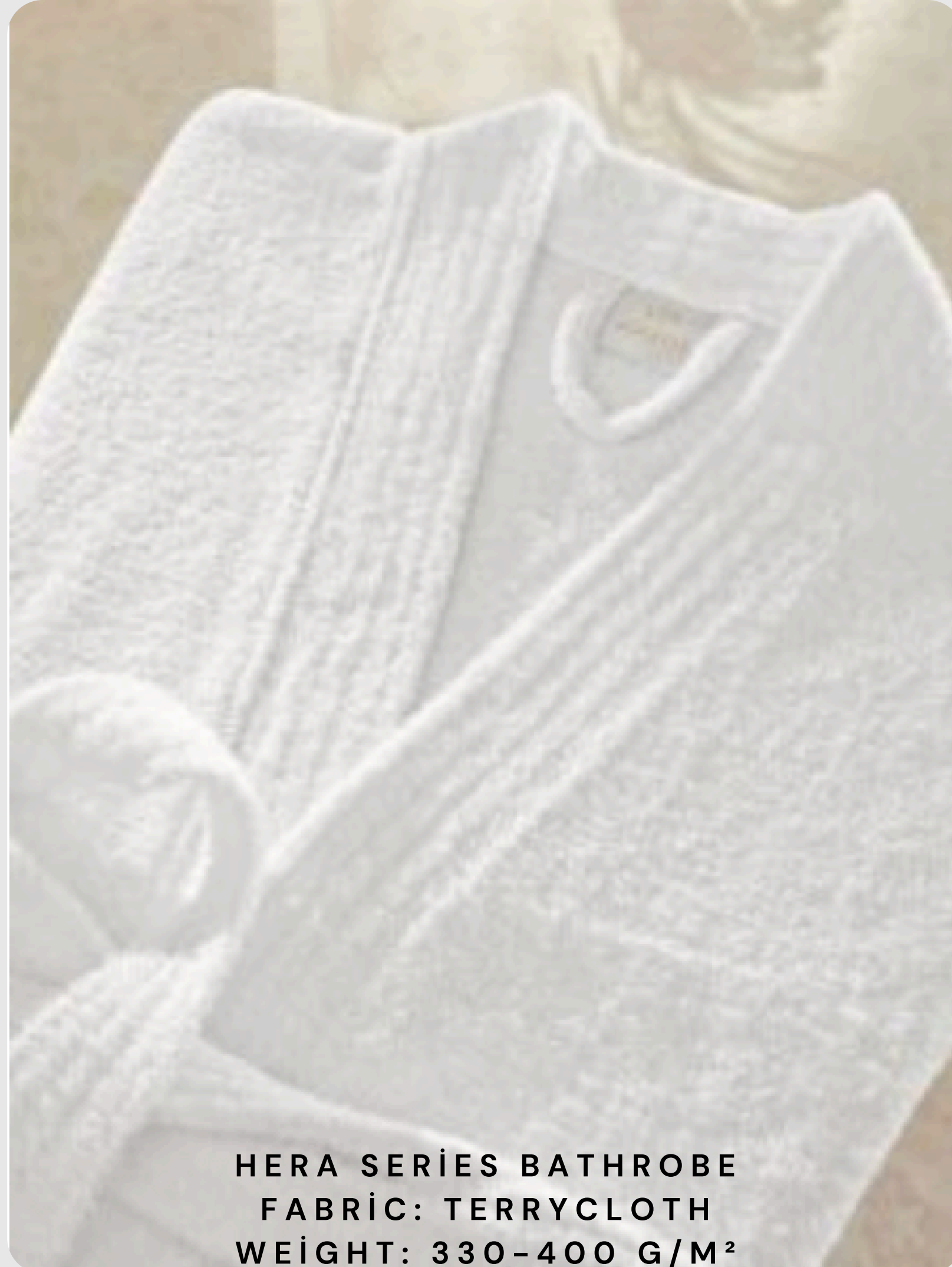
HERA SERIES BATHROBE FABRIC: TERRY CLOTH WEIGHT: 330-400 G/M 2