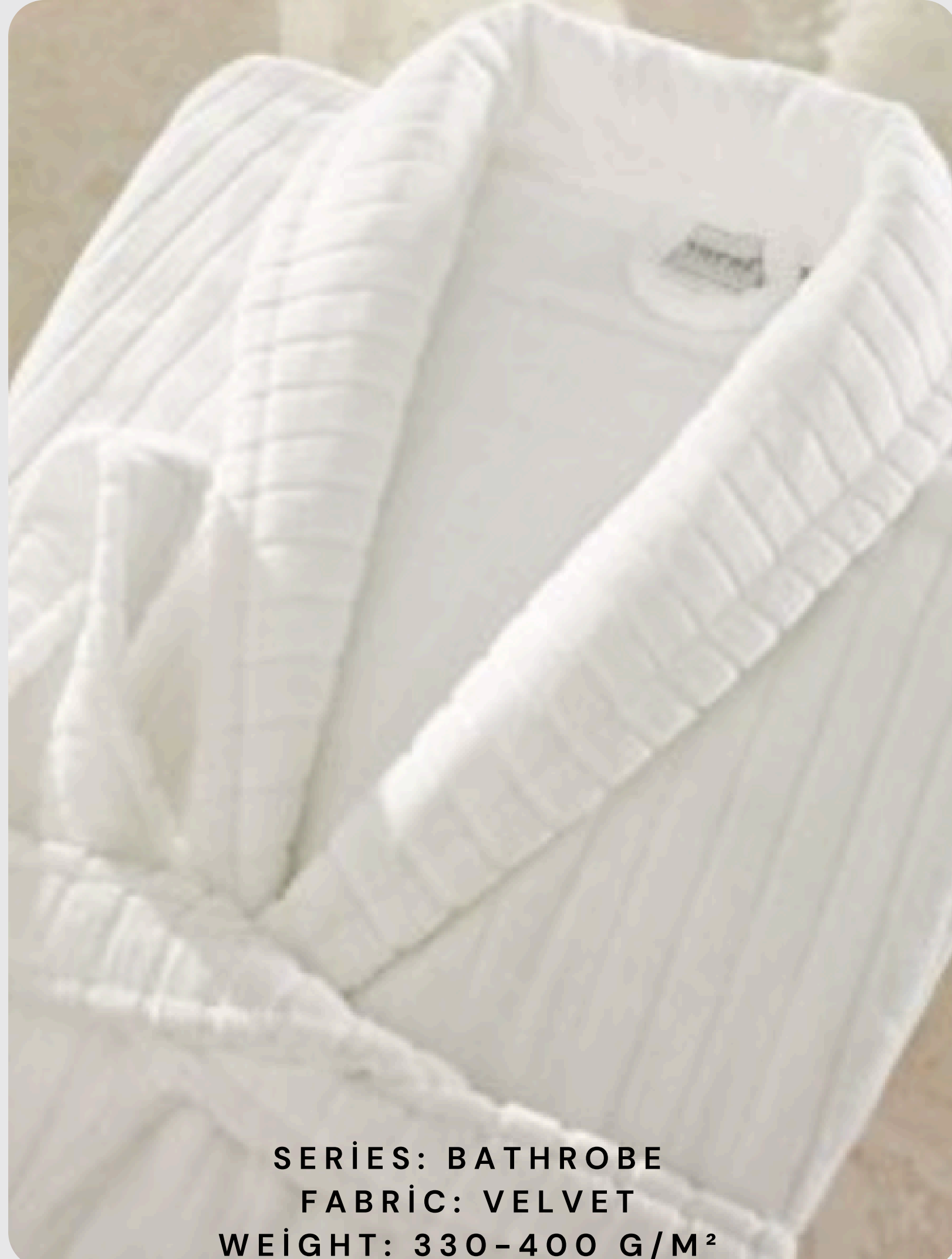
SERIES: BATHROBE FABRIC: VELVET WEIGHT: 330-400 G/M 2