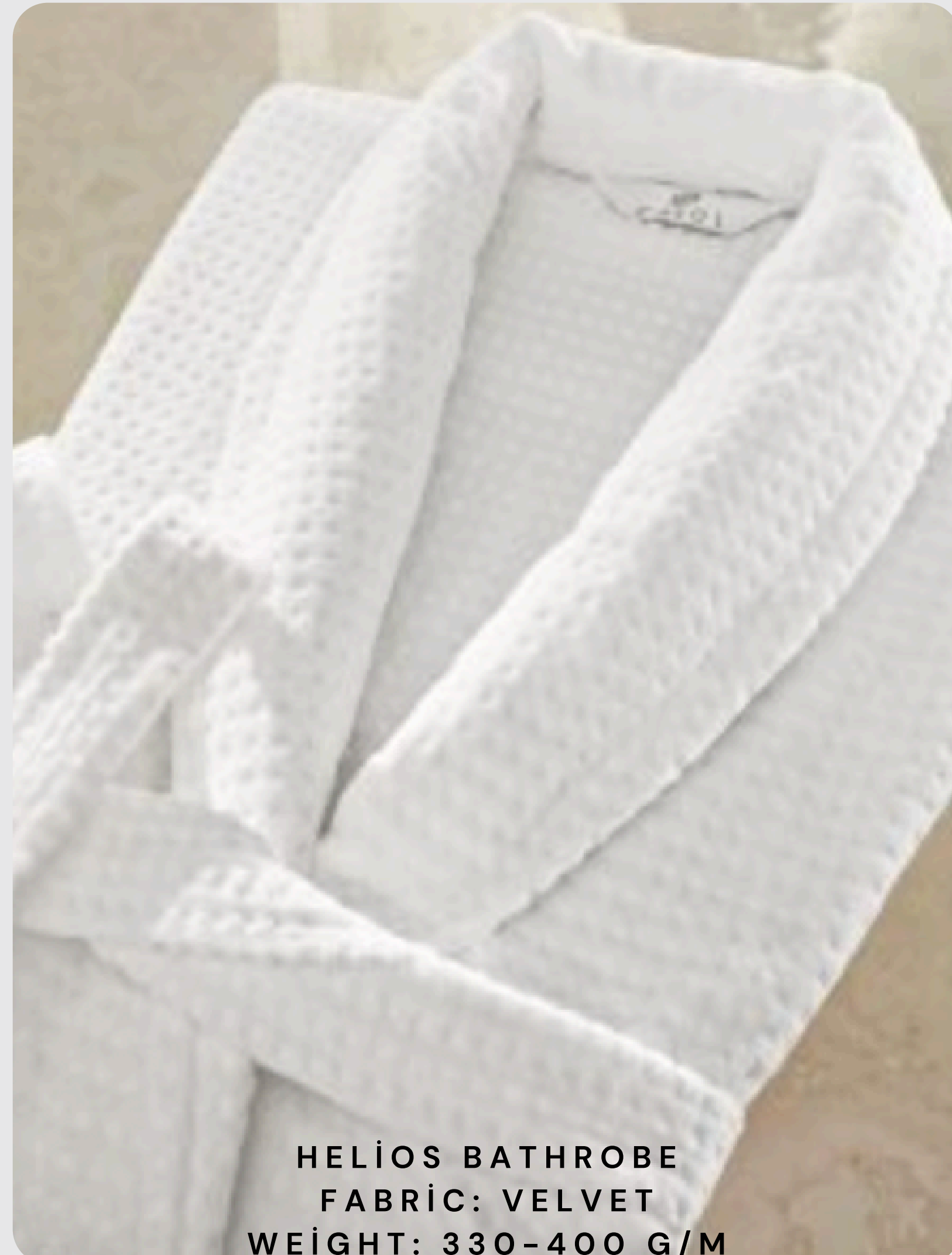
HELIOS BATHROBE FABRIC: VELVET WEIGHT: 330-400 G/M