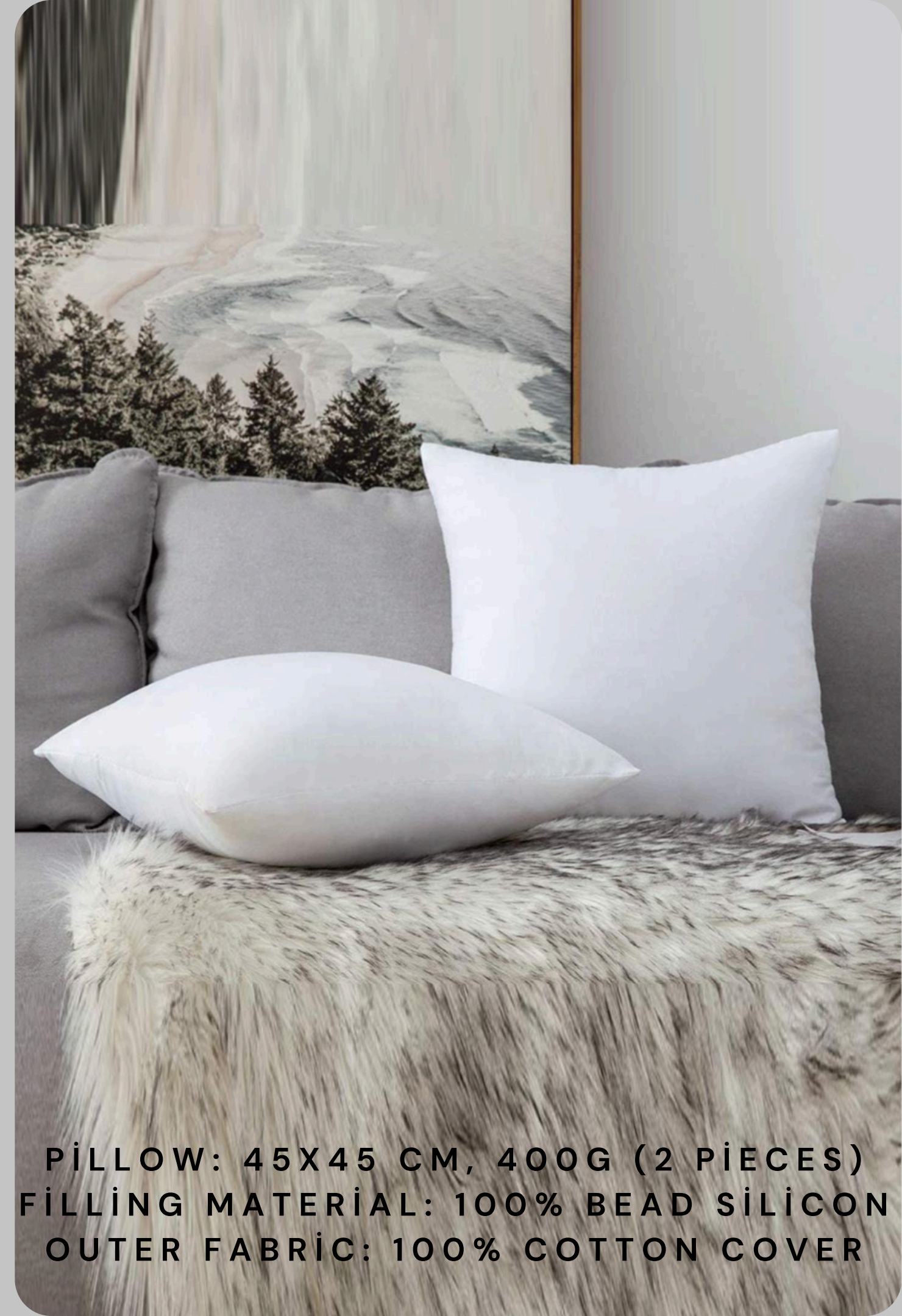
PILLOW: 45X45 CM, 400G (2 PIECES) FILLING MATERIAL: 100% BEAD SILICON OUTER FABRIC: 100% COTTON COVER