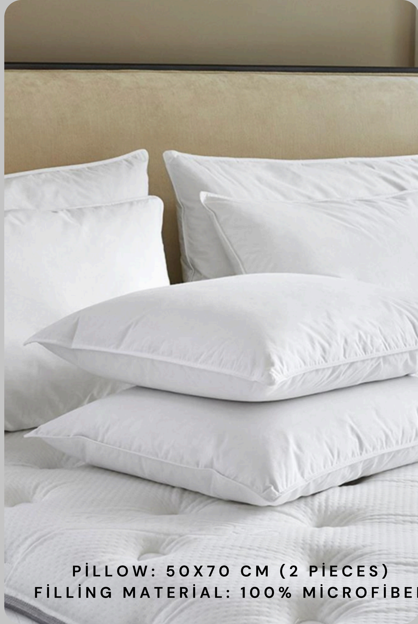
PILLOW: 50X70 CM (2 PIECES) FILLING MATERIAL: 100% MICROFIBER